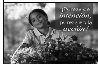
¡Pureza de intención, pureza en la acción!