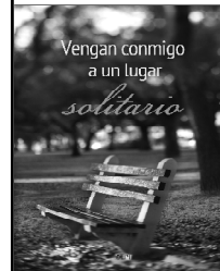
Vengan conmigo a un lugar solitario