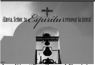
Envía, Señor, tu Espíritu a renovar la tierra!

PEARLE ZALUD FUND SCHOLARSHIP High school seniors and continuing full-time college students may apply. Their selected major must be in music or agriculture. Applications are available in the church office. Deadline is July 31, 2015.